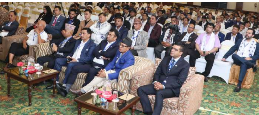
Representatives of HAN member hotels from across the country attend the AGM

The meeting which was attended by member hotels from across the country deliberated atlength current scenario of the hospitality business and recommended HAN leadership to take on rising problems with Banks in regards to repayment of loans, government treatment to hotels as priority industry and promotional activities for increasing businesses.